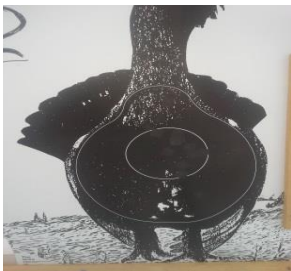
Tiur sitt 100 m