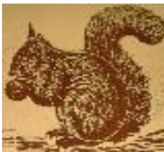
Ekorn sitt 52 m