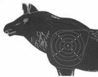
Elgkalv ligg 170 m